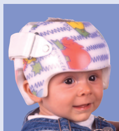
STARband™ Side-Opening Band