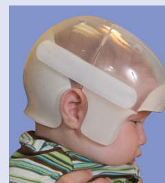
STARlight™ PRO Side Opening Band

First helmet for post-endoscopic craniectomy