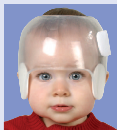
STARlight™ Side Opening Band