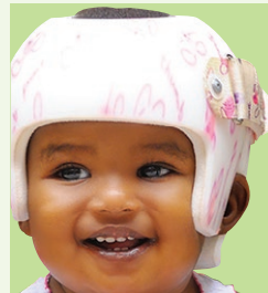
STARband™ Side-Opening Band