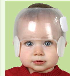
STARlight™ Side Opening Band