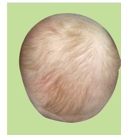
After STARband Treatment

ORTHOMERICA ® 6333 North Orange Blossom Trail • Orlando FL 32810 • USA 877-737-8444 | www.orthomerica.com